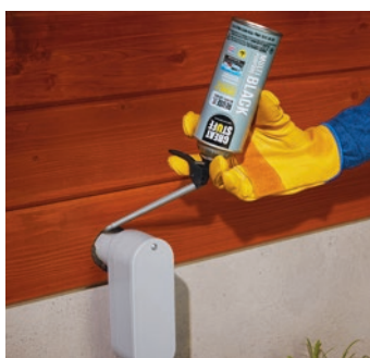
Around Electrical Lines