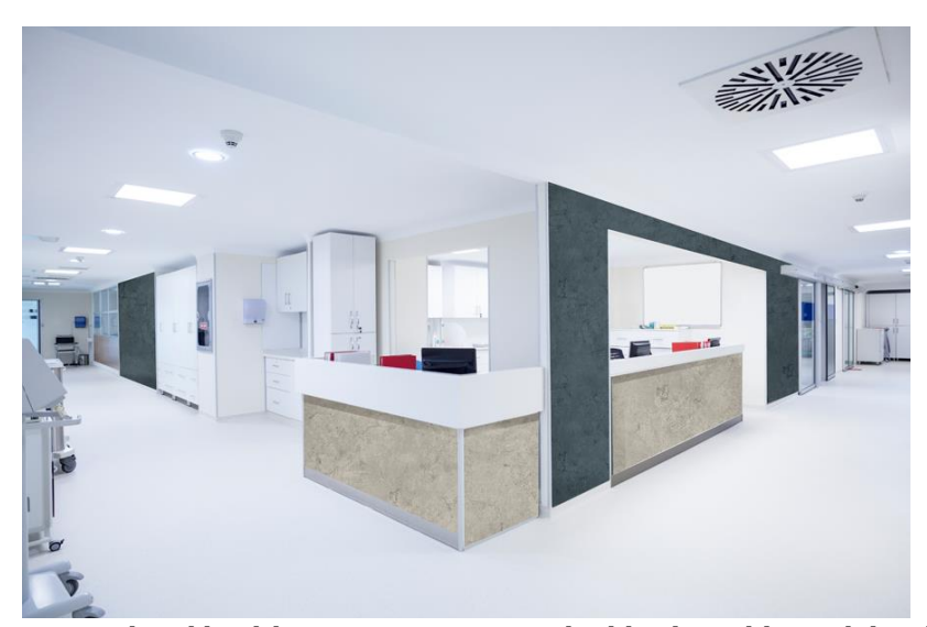
Hospital and healthcare spaces require highly cleanable, and durable wallcoverings.

The film, which is manufactured at plants in New York, and Ohio and comes in over 20 different colors, is distributed across North America, with DuPont eyeing expansion into Europe, the Middle East and Africa. China is an especially promising market, where Tedlar® has been a key component in several innovative construction projects.