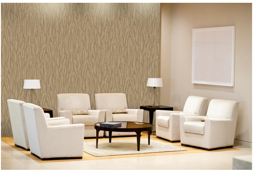
The style-forward Tedlar® Wallcoverings are ideal for protecting healthcare spaces with frequent cleaning in high-traffic areas.

"We're seeing increasing demand from architects and designers working on hospitals or on hospitality projects, such as hotels and restaurants," he explains. "Tedlar® is perfect for interior wallcoverings and surfaces because of its extreme durability, cleanability and resistance to harsh chemicals. These qualities are more important than ever when creating highly cleanable spaces in a post-COVID world."